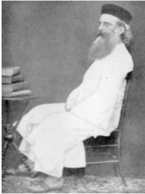
COL. HENRY STEEL OLCOTT IN 1883 Originally published in The Theosophist , Vol. LIII, August, 1932.