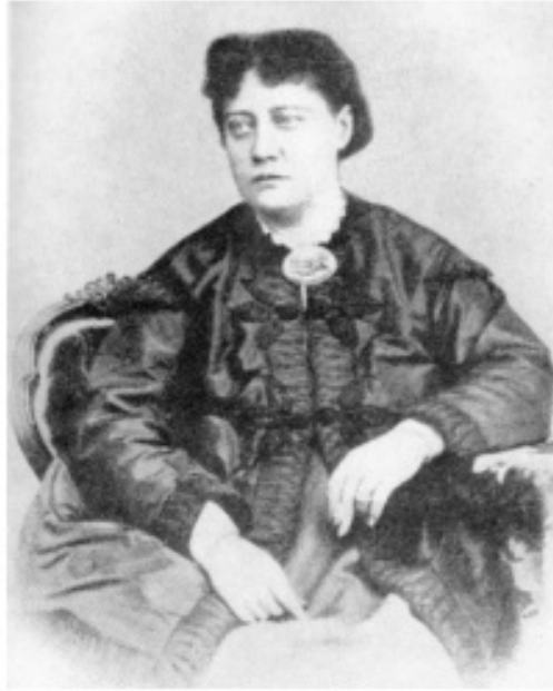
H. P. BLAVATSKY IN HER FORTIES Reproduced from Incidents in the Life of Madame Blavatsky , by A. P. Sinnett. 2nd ed. London: Theos. Publ. Society, 1913.