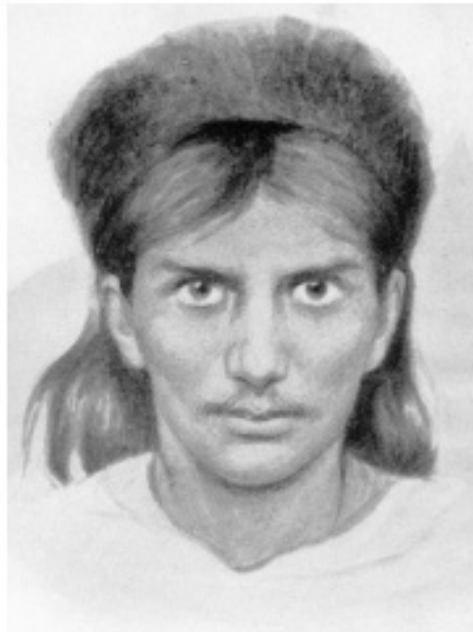
DAMODAR K. MAVALANKAR