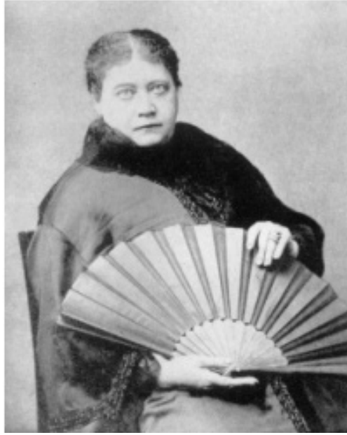
HELENA PETROVNA BLAVATSKY Picture taken in London, in 1884